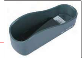
base with calibration block (included)