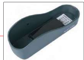
base with calibration block (included)