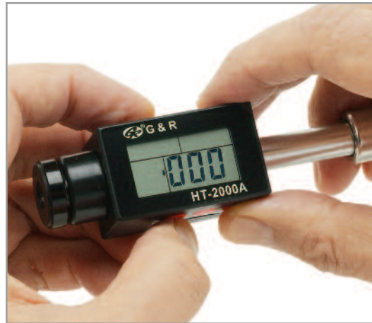
1. Select the material, hardness scale and direction.

The HT-1000A and HT-2000A have many applications in the primary metals, metal fabrication, utilities, petroleum, chemical, automotive and aerospace industries. Their small size and easy to use, one-handed operation make them ideal for testing large and heavy forgings or castings, such as steel mill rolls and turbine housings. Also, due to their small size and portability, the testers can be used to test individual parts of a large assembly without taking the finished assembly apart. The testers can be used vertically or horizontally, and require only a small surface area to obtain a quick and accurate reading. These versatile testers can be easily used by anyone, anywhere, to obtain direct accurate hardness readings.