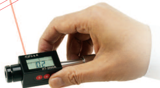
5. Transmit Data. (HT-2000A only)