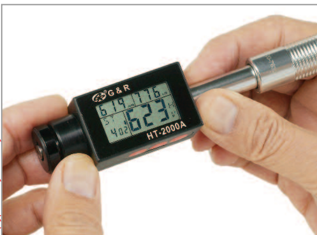
4. Read hardness.