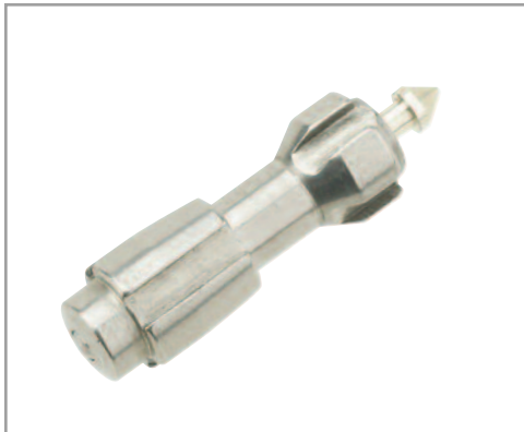
Diamond Impact Body

HT-2000A Package Includes: HT-2000A Hardness Tester Standard Test Block Micro Infrared Printer Support Ring .79" (20 mm) Support Ring .53" (13 mm) Plastic Carrying Case Tube Cleaning Brush CR-2330 Lithium Batteries (2) Operating Manual