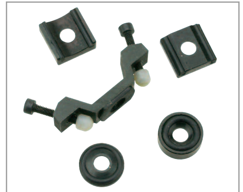
Special Support Rings