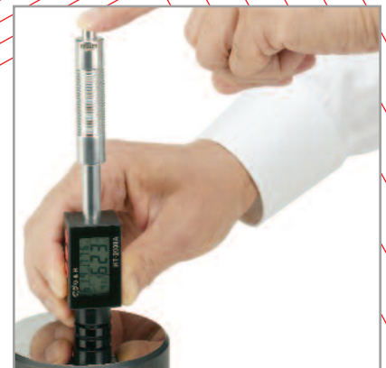
3. Place it on the material to be tested and push the button.