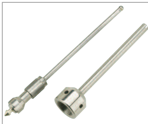
Long Test Tip Impact Body