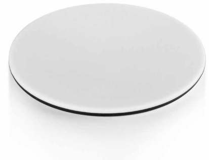
Stage plate white