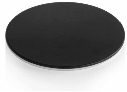
Stage plate black