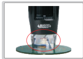
focus supporting ring for 60X/200X