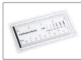
calibration rule (graduation 1mm)