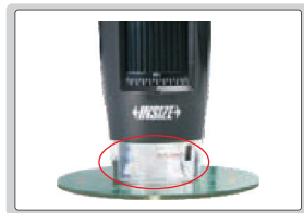
focus supporting ring for 80X/150X