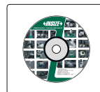
software CD (included)